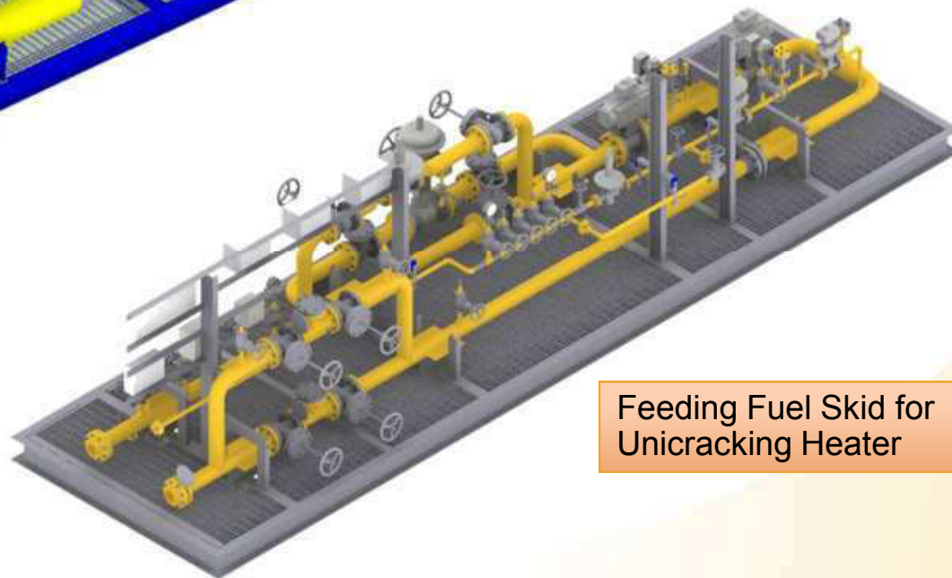
Feeding Fuel Skid for Unicracking Heater