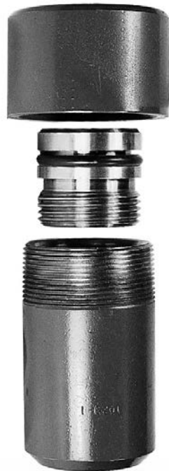
■ THREAD-O-RING™ Fittings