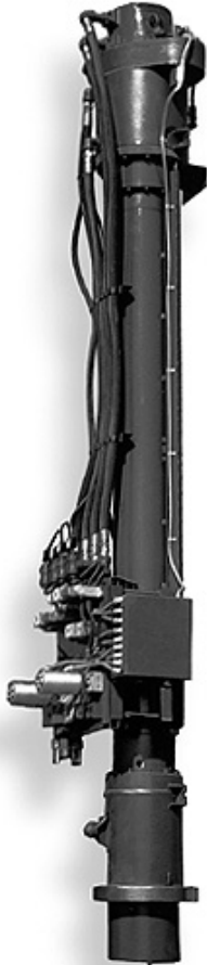
■ 2400 Tapping Machine