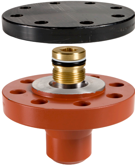
■ THREAD-O-RING™ Flanged Fittings